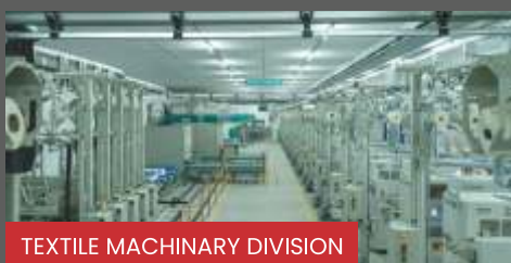
TEXTILE MACHINERY DIVISION